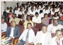
A cross-section of guests at the Lecture