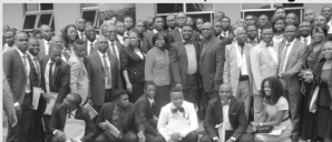
Principal Officers of the University, staff of the College of Health Sciences and the Inductees