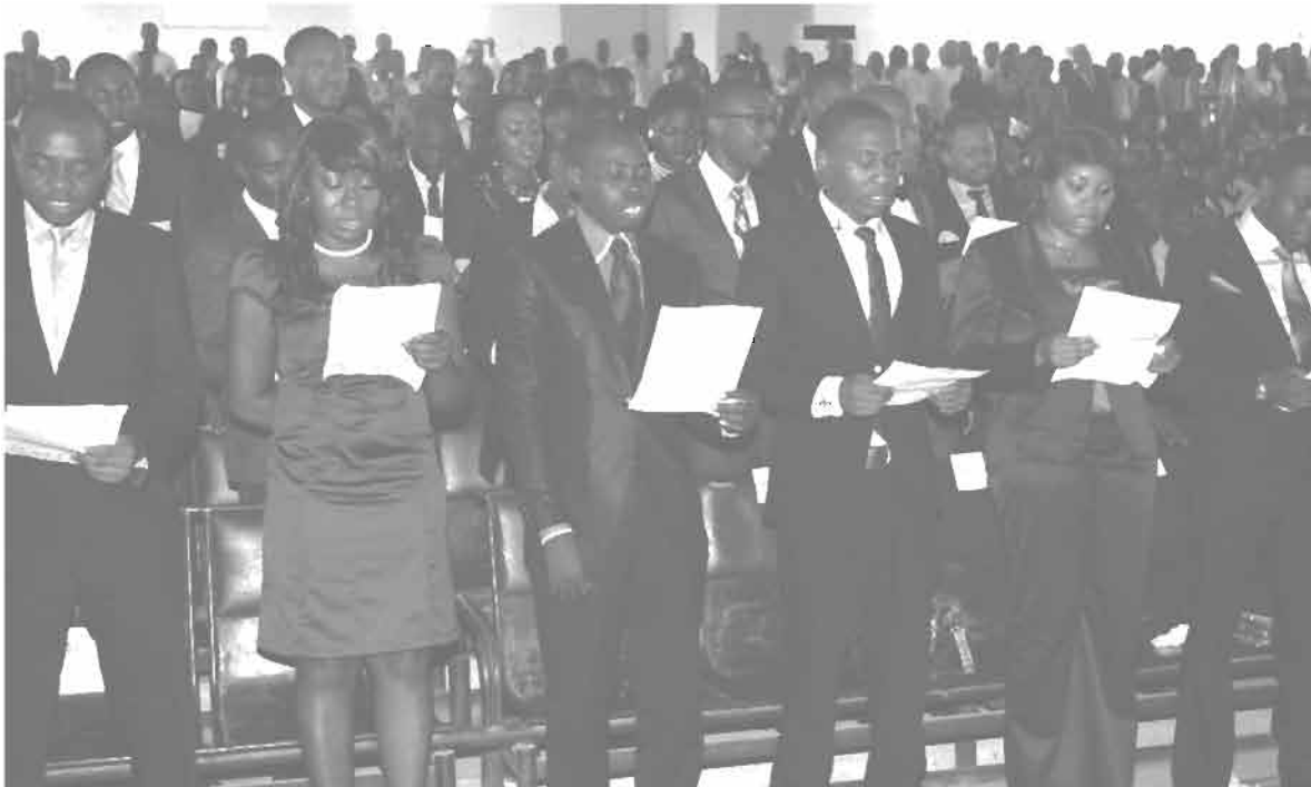
A cross section of the New Doctors taking the Physicians' Oath