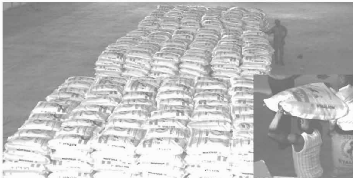
Innovation: Ajienska's welfare package for 2011 Xmas, (inset, distribution in progress)

"We are collaborating with the Niger Delta Development Commission (NDDC) in programmes aimed at creating more job opportunities for