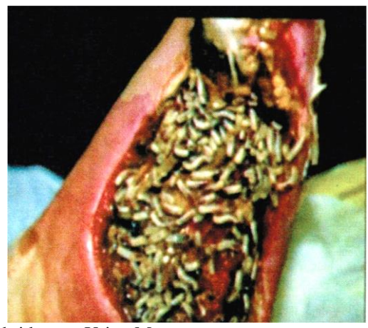
Biological Debridement Using Maggot