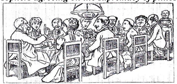
Philosophers defining "philosophy"

Philosophers agreeing on the supremacy of philosophy