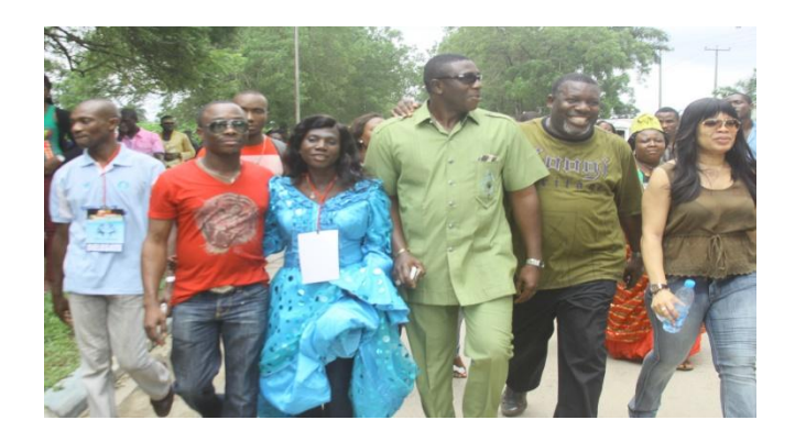
The Crabites – Demi - Gods of Artistic Creativity