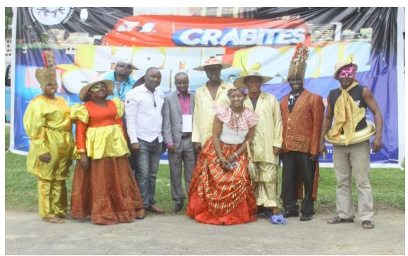
Executive Producers - CRABITES Homecoming 2012

Oshimili (1994 & 1997) Adams Family (1995, 1999, 2005, 2010 & 2014), Marriage Coup (1996 & 2012), each of which has been staged at different times in the Garden City. In addition, one of the tales in Three Tales Three Tribes (2019) titled the Queen and the Prince was harvested as a dance drama at the CRAB by Dan Kpodoh in 2009 under the title Queen Morenike. My most recent creative work in prose is Konye (2023) which has had favourable mention in many quarters in the Garden City and beyond. All these have served as great materials for entertainment and education. Below is a table reflecting my artistic preoccupation in the Garden since the 1990s.