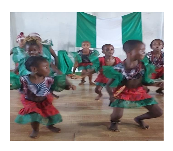
Independence Day Children Celebration 2023