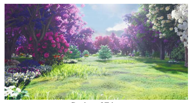
Garden of Eden

This insinuates an environment of wondrous beauty, profiling the grandeur and aesthetic perfection of God the creator in the image of a scenic designer par excellence. In an amazing transformation of the Garden of Eden into an artistic creative space, the Bible reveals that God in the image of a costumier "made garments of skin for Adam and his wife and with these he clothed them" (Gen. 3:21). As Lighting Designer, he created light by his declaration, "Let there be light" (Gen. 1:3) and light came to exist, separating light from darkness, night from day and sun from moon. In setting the stage and in performing His act, as the director, God only needed to speak, decree, or instruct, to have the actions effected with aesthetic lushness, separating sky from sea, dry land from vegetation, trees from bushes, and flowers from shrubs. Also created in that tradition, were animals of different species, including birds for the sky and fishes for the sea who served as the audience for the performance. All these had coalesced into the spatial illusion of the Garden of Eden; an idyllic stage setting where two human characters He had created, made their entries