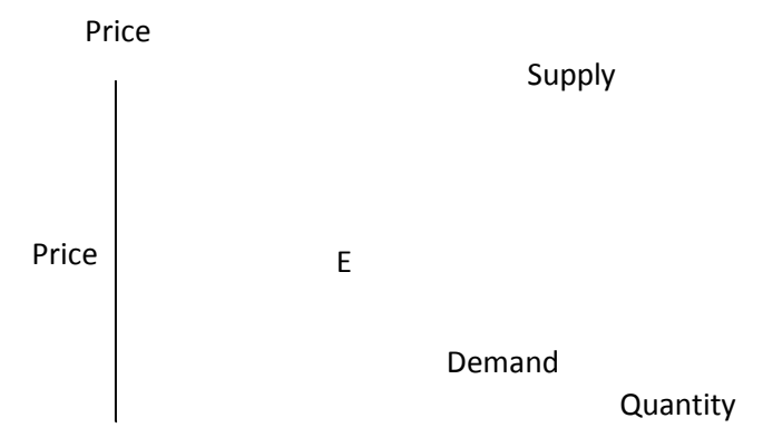
Figure 1: Supply and Demand

there were no demand and supply, there would not have been "Economics" as a special field of study, Gbosi (2015). Many people when they talk about economics, think first about the slogan Supply equals Demand and its prices. As shown in figure 1, we have a rising supply function intersecting a falling demand function determining equilibrium price and quantity. This simply means that when the price of a commodity is high, the quantity demanded will fall. But when the price falls, the quantity demanded will increase. The price at which the quantity demanded equals the quantity supplied is called the equilibrium price. As shown in the figure 1, point E on the graph is the equilibrium price.