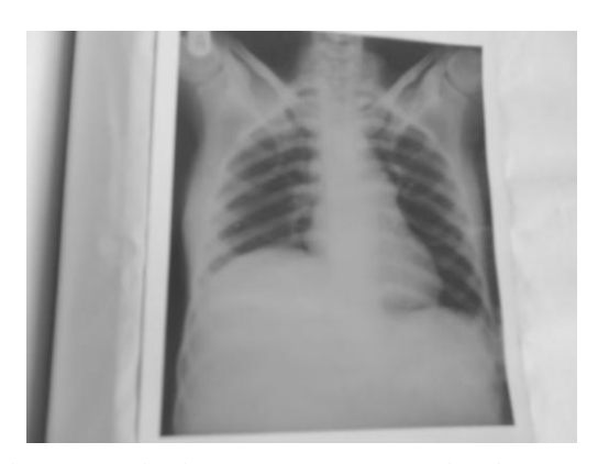
Elevated right hemi-diaphragm due to ALA.

Using these criteria, we evaluated a series of sixty patients at the University of Nigeria Teaching hospital, Enugu, and were able to show that some of the teachings about amoebic liver abscess written in Standard textbooks of medicine were not applicable to our environment. For instance, jaundice was said to be rare or uncommon in amoebic liver abscess. (Adi FC 1965;Salako 1967; Cain GD et al 1968), and that it is a feature of pyogenic liver abscess rather than of amoebic aetiology. But we were able to show that jaundice was a prominent presenting feature, occurring in 28.3 percent of our series (Ihekwaba 1988; Ihekwaba AE, Mgbor SO, Ukabam SO 1993))