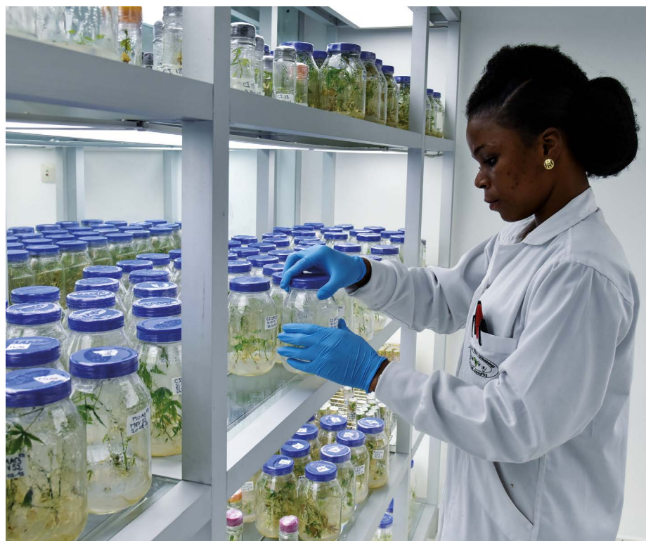
A technician checks cassava plants in a research laboratory near Abidjan, Côte d'Ivoire.

As written, however, the Nagoya Protocol has gaps when it comes to Africa. It fails to take into account the customs and practices of the diverse ethnic groups across the