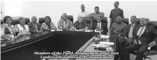
Members of the Panel, Management and Union Leaders who witnessed the inauguration

It would be recalled that the Governing Council at its 156 th Meeting deliberated extensively on a Report presented to it by the Management and deeply regretted the death of the student. Council thereafter directed Management to pay a Condolence Visit to the family of the deceased student and participate in his burial. The highest policy-making body also ratified the decision of Senate to shut down the University for one month, amongst other decisions.