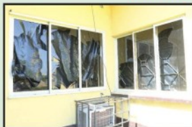
Another view of the Old Students' Affair Building