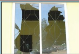
Old Students' Affair Building

Once again, we bring you more gory scenes from the "peaceful protest" by students of the University of Port Harcourt on Monday, April 11, 2016, which resulted in loss of life and widespread destruction of private and public property as captured by our Camera-man, HEADMANALU :