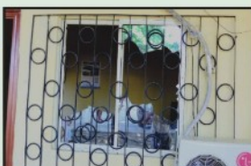
Automotive Laboratory Building with some laptops looted