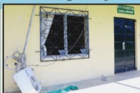
Institute of Agricultural Research and Development (IARD)