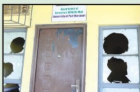
Dept. of Forestry and Wildlife, Faculty of Agriculture