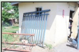
Vandalised Choba Park Gate