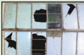
Central Community Service Unit Building