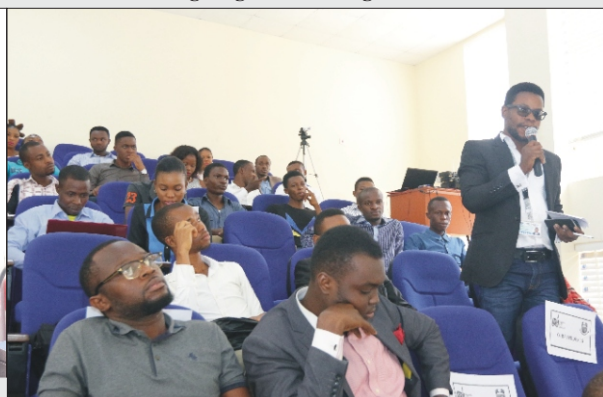
Cross-sections of the participants at the Lecture