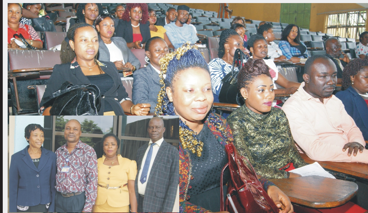
Cross-section of Secretaries at the event. Inset: The newly-inaugurated UniPort USSA EXCO