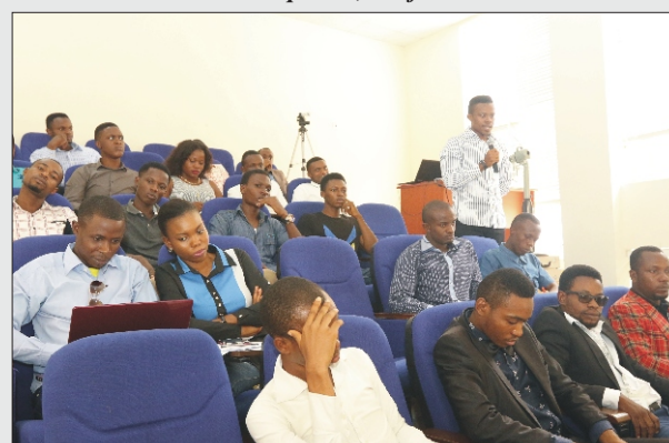
Another cross-section of participants