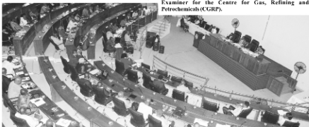
Senate in session

Senate also considered and approved results from the Faculties of Humanities, Social Sciences, Science, Education, Engineering, Management Sciences, Pharmaceutical Sciences, Agriculture, College of Health Sciences, as well as the School of Graduate Studies. The apex academic regulatory body also ratified results as executive approved by the Vice-Chancellor, as well as an External Examiner for the Centre for Gas, Refining and Petrochemicals (CGRP).