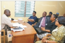
The Commander addressing his Guests