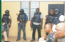
Some of the officers of the Nigeria Police and UniPort