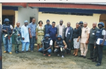
A group photograph of Principal and Senior officers of the University and men of the Nigeria Police