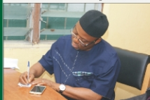
V-C taking some notes