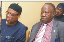
V-C and his Deputy in charge of Administration