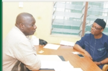
The Base Commander and V-C during close door session