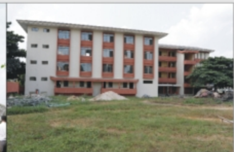
Another view of the renovated hostels at the University Park