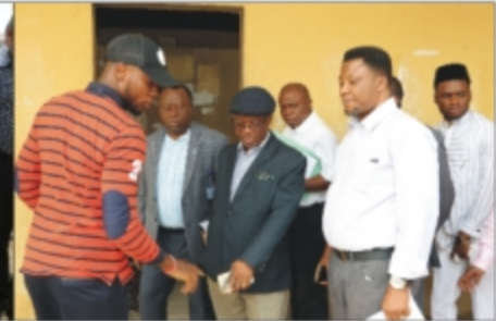
V-C, Prof Lale and others interacting with contractors on site