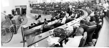
Senate in session

The approval was given following a presentation by the Deputy Vice-Chancellor (Academic), Professor Hakeem Fawehinmi, based on a recommendation by the Senate Committee on Academic Programmes and Policies (SCAPP). Senate considered and approved the proposal at its 428 th Meeting which