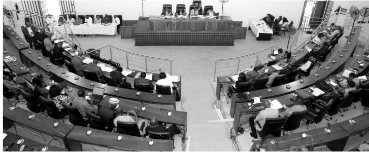
447 th Senate in session

The Offshore Technology Institute (OTI) was similarly granted approval to run the Master of Science degree in Energy Access and Renewal Energy Technology. The School of Public Health also received approval to run four