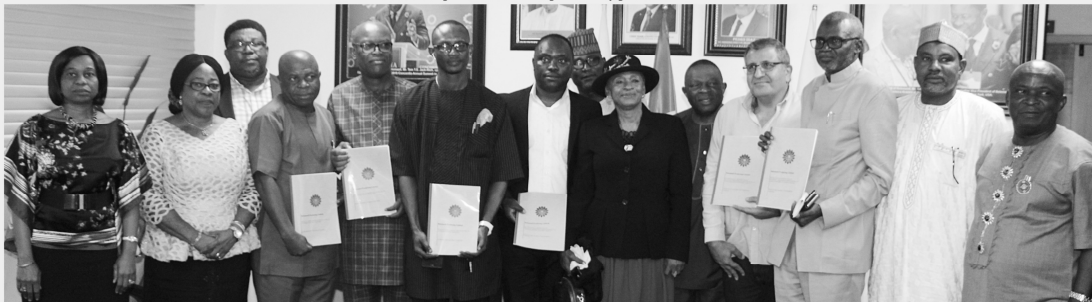
A group photograph of delegates from UniPort, Usmanu Danfodiyo University and Belema Oil