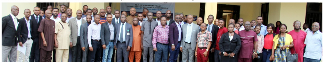
A group photograph of the Resource Persons and participants