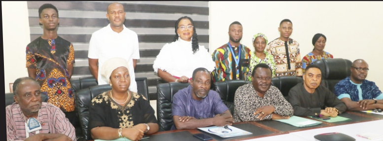
Management, Resource Persons and Staff of SGS at the event

In a bid to acquaint newly-admitted Graduate Students with the policies of the graduate programmes of the University, the leadership of the School of Graduate Studies held a virtual orientation exercise for the new intake on Friday, July 9, 2021.