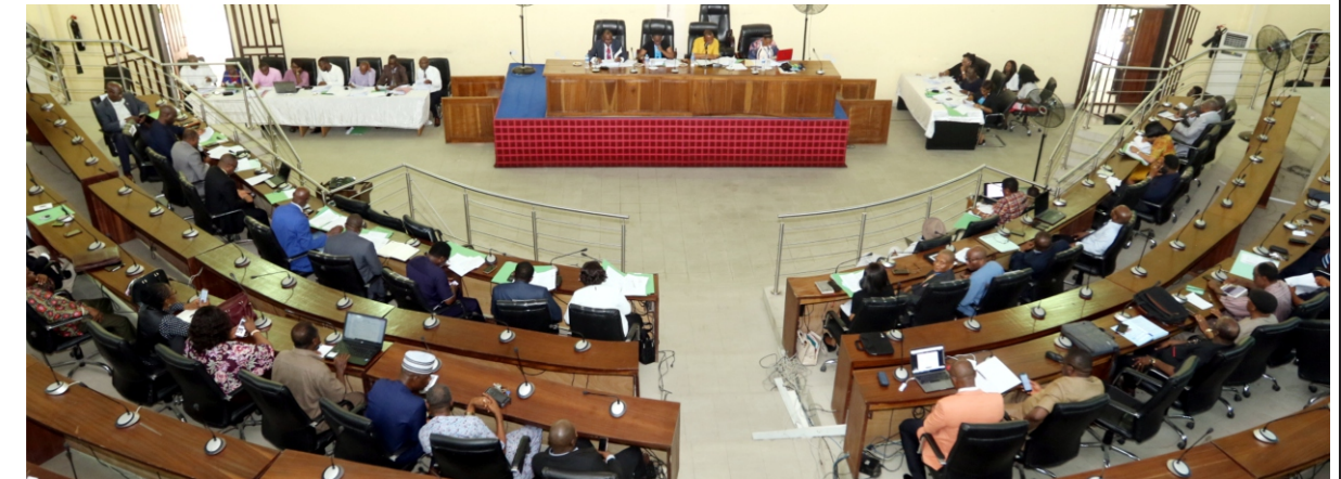
458 th Senate in Session

With the approval, Faculty of Communication and Media Studies would run four Departments comprising Departments of Journalism and Media Studies, Public Relations and Advertising, Broadcasting, and Film Production, while Faculty of Computing has Departments of Computer Science, Software Engineering, Information Technology, and Data Science.