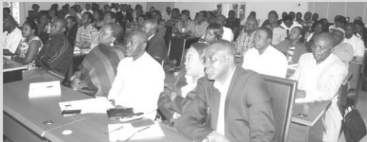
Cross section of students at the exercise

The UPBS offers Master of Business Administration (MBA) in Accounting, Management, Finance and Banking, Marketing, Security Management and Healthcare Management. PGD Programmes are also offered in Management, Hotel and Tourism Management, Security Management and Healthcare Management.