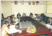
Council in session