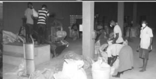
Staff processing feed