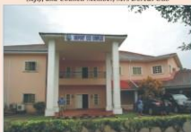
Front view of the complex