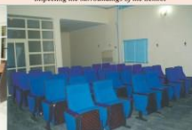
One of the seminar rooms