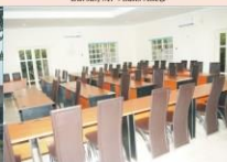
A view of the Conference Room