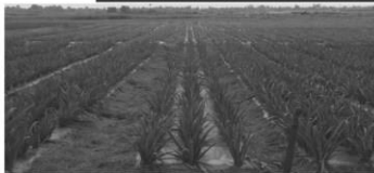
A view of the farm