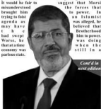
Cont'd in next edition

It would be fair to suggest that Morsi misadvised brought him to power. In trying to feist an agenda as may have had swept Worse, he that at a time country was parlous state.