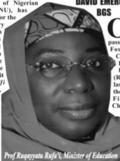
Prof Ruqayyatu Rufa'i, Minister of Education