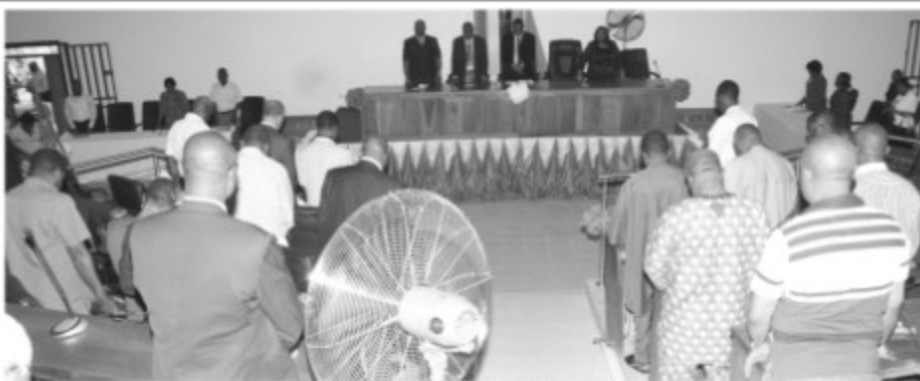
Senate members at an emergency session