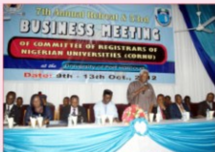
A cross section of dignitaries on the high table