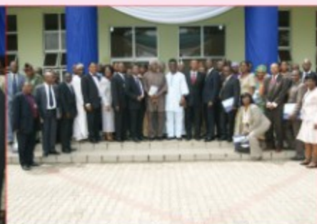
A group photograph of participants at the opening ceremony