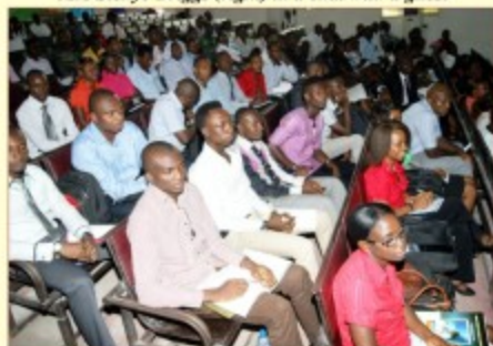
Cross-section of participants at the Conference