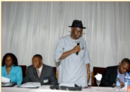
Chairman of the occasion, Senator Magnus Abe, making a speech