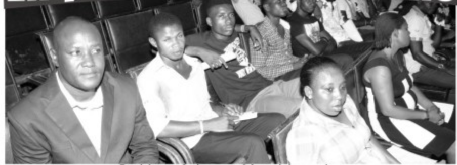
Participants during one of the training sessions