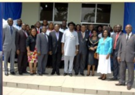
Dignitaries and participants in a group photograph