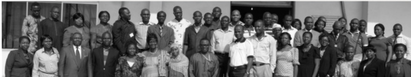
Participants at the two-day Workshop

This observation was part of submissions made at a two-day Stakeholders' Workshop organized by the United States Alumni Engagement Innovation Team with the theme: "Clean the Spills: Going Green in the Niger Delta" at the International Students' Centre.