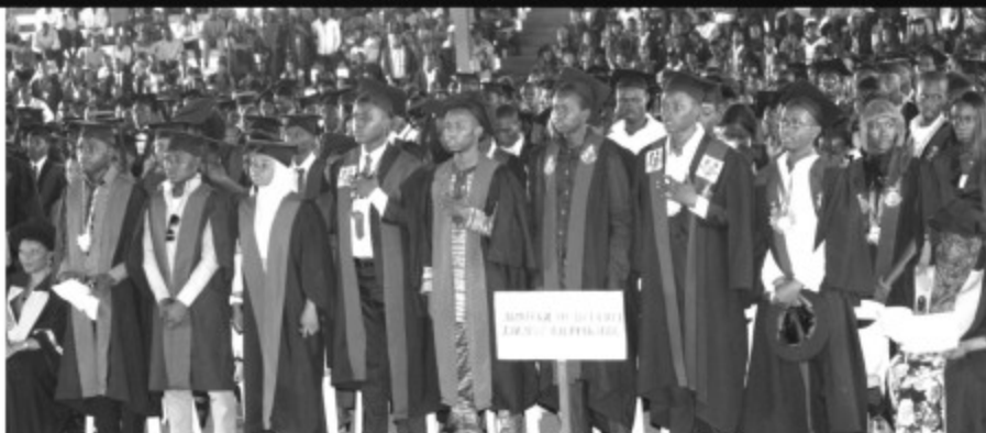
A cross-section of students taking the Matriculation Oath