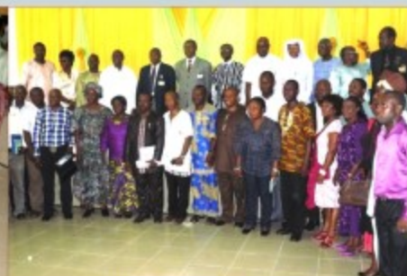
A cross section of participants