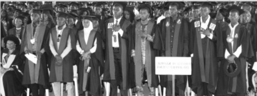
Cross-section of Matriculants taking the Oath

So, after the celebrations what next? Pinging on BlackBerry phones? Chatting on Facebook? WhatsApp? 2go, etc? Or settling down to business—studying? Whatever the case, it's a matter of choice. What a privilege and a huge challenge.