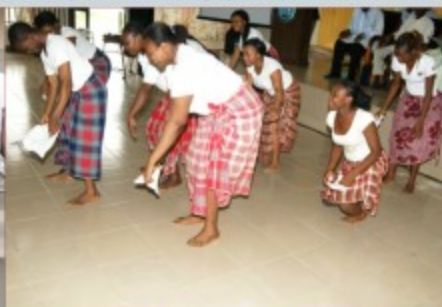
UNIPORT Concert Chorus performing