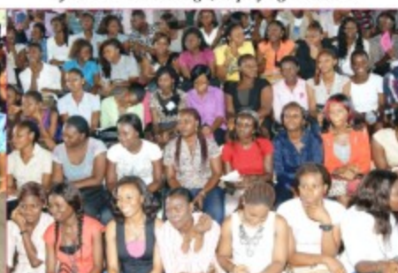
A Cross-section of students at the ceremony