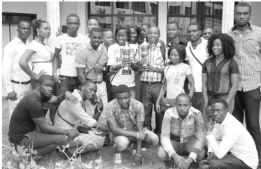
Winners of the Williamson, Emenanjo Cups pose for a group photograph