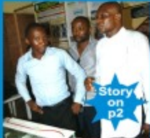
RCB, UNI PORT Graduate, Partner On Bio-Electricity Research