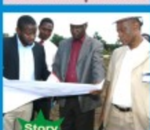
V-C Lays Foundation For A-Level School