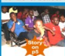
V-C Cautions SSLLT Students Against Unruly Conduct