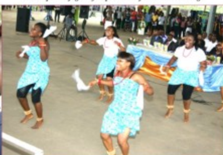
Dance troupe from Department of Theatre Art entertaining participants