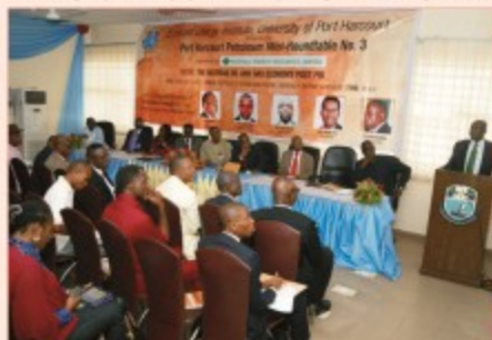
Participants listening to a presentation