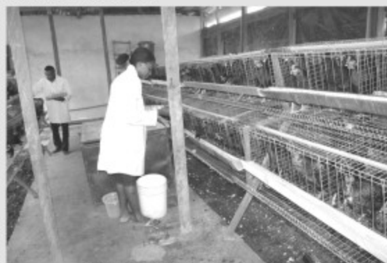
Interns picking eggs at the poultry