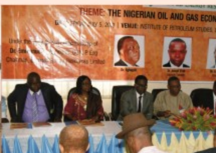
A front view of Resource persons at the event