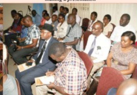
A cross section of participants