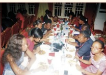
Some of the graduates at the dinner