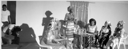
A scene from one of the plays