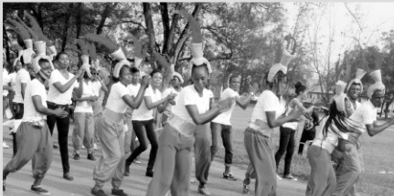
Some students celebrating the week