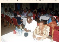
A cross-section of guests at the Dinner