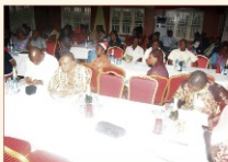
Another view of guests