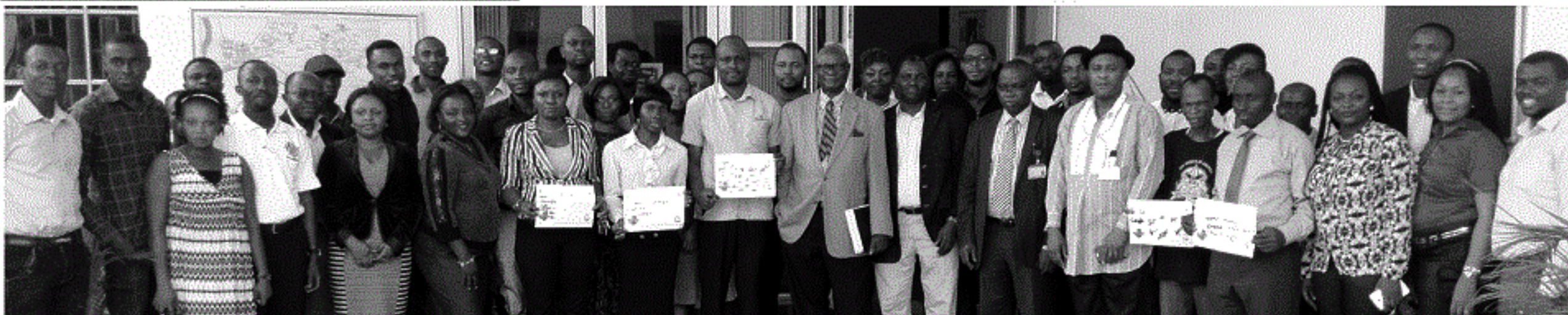
Participants at the event

According to the organisers of the event, the group photograph showing participants and the signed Environmental Pledge Board would be uploaded on the UNEP website as a demonstration of solidarity and commitment towards global environmental stewardship sustainability.