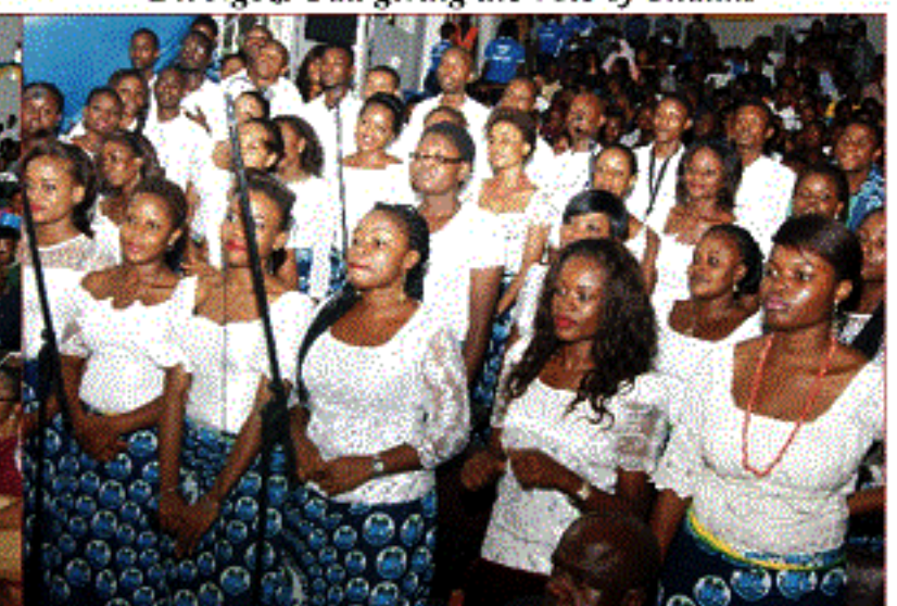
UniPort Concert Chorus performing