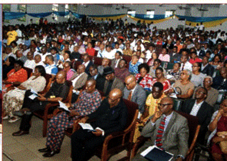
A cross-section of guests