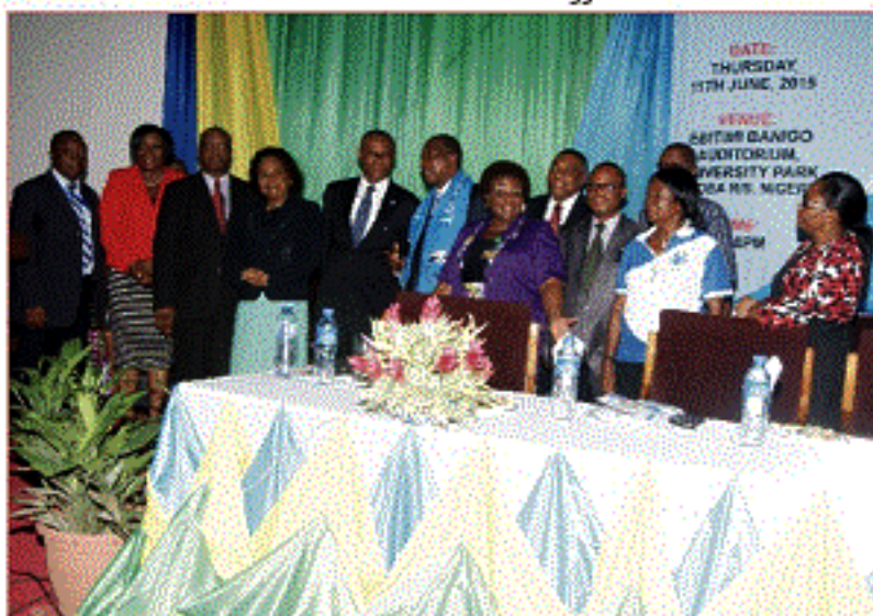
Senior Officials of the University posing with the Convocation Lecturer