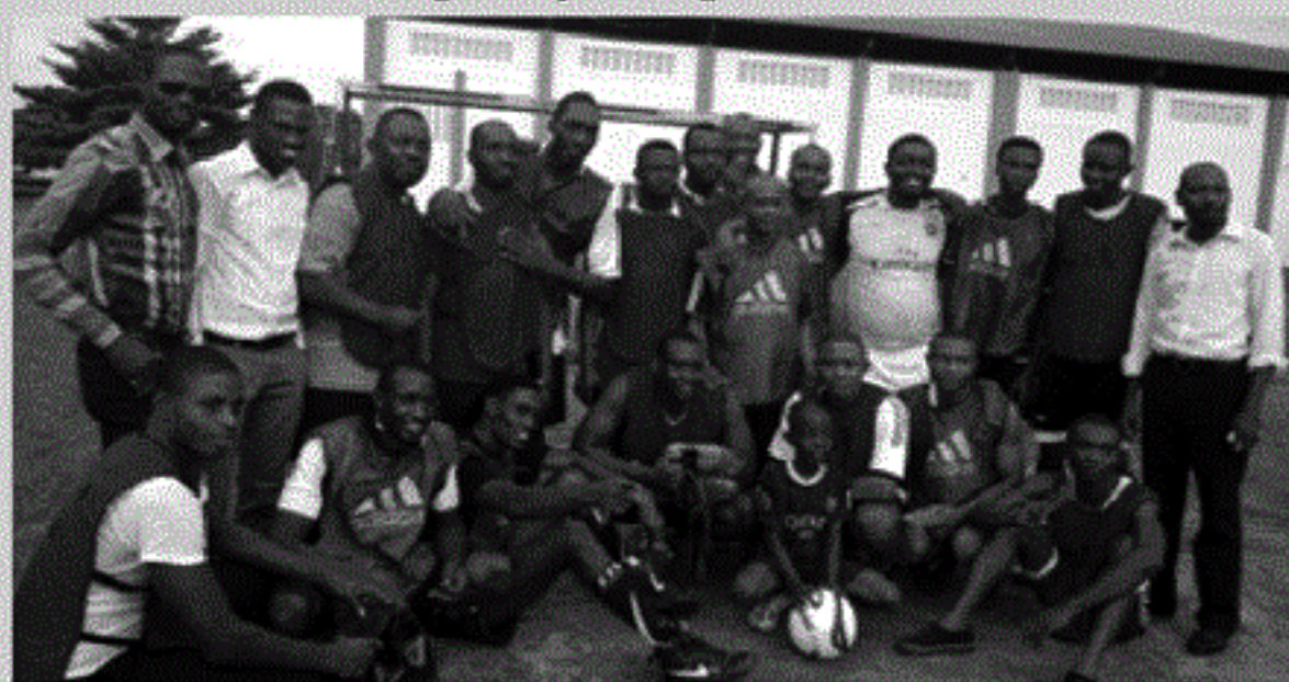
Senior Staff Club Team in soccer mood