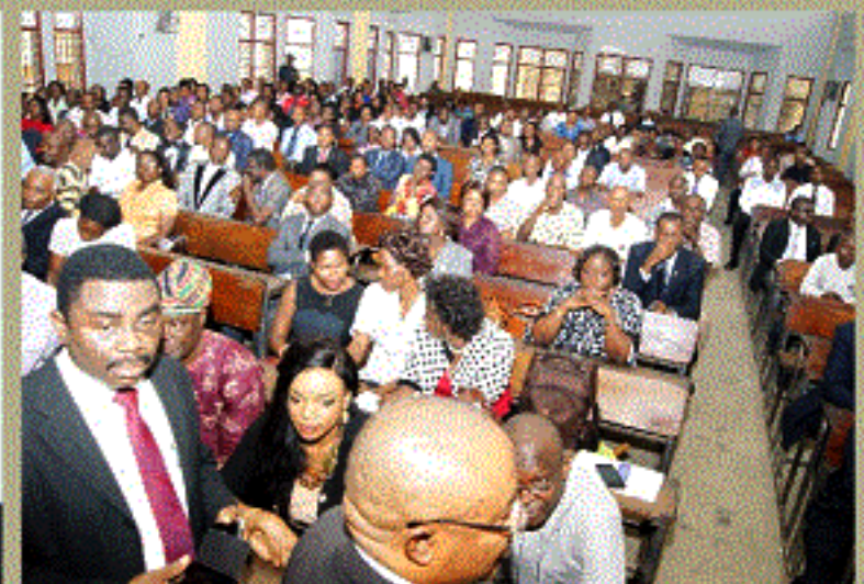
A cross-section of staff of the College of Health Sciences at an interactive session with the V-C