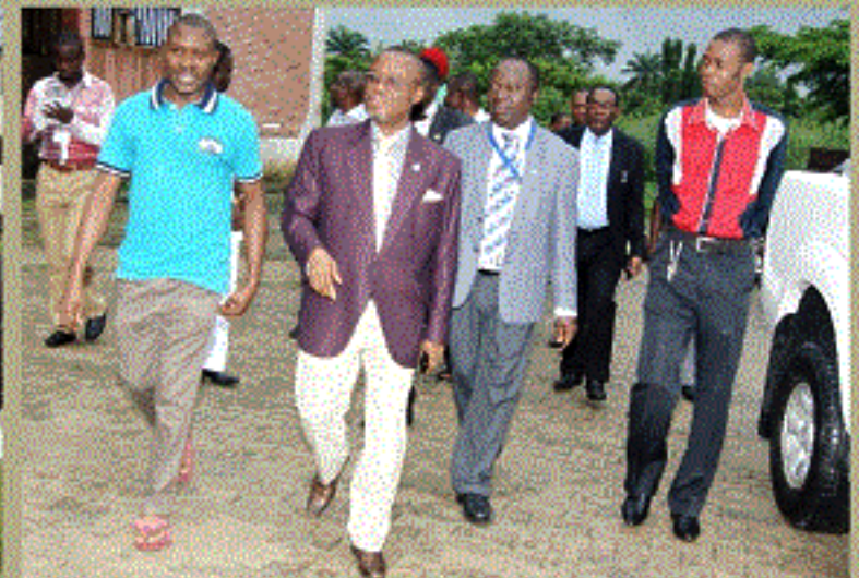
V-C and his entourage inspecting facilities behind the Nursing Hotels, University Park