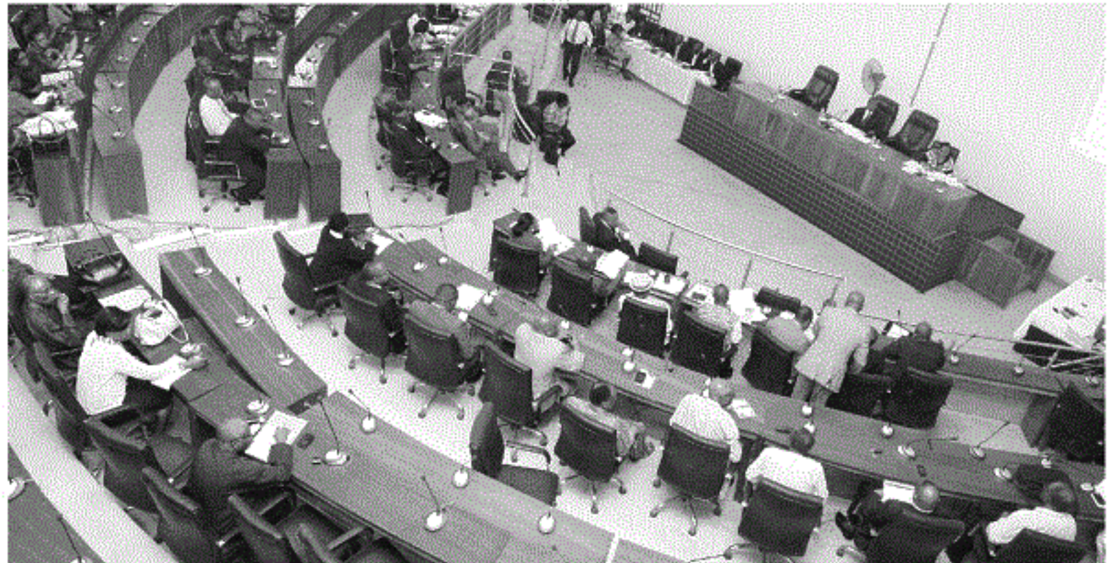
Senate in Session

Yet another application for reinstatement to academic programme in the Department of Environmental Engineering presented by Provost of the College of Engineering, amongst others, was also considered and approved by Senate.