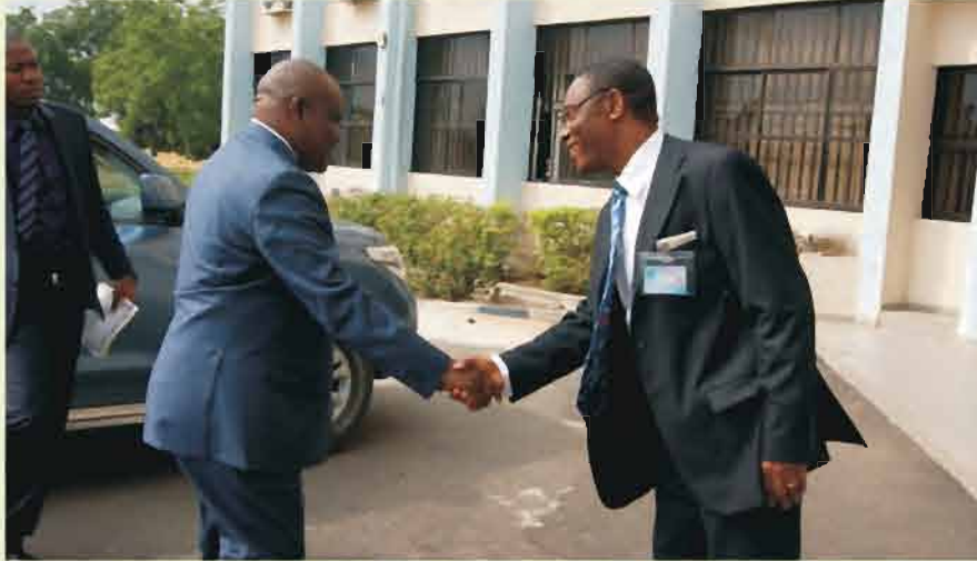
V-C, Prof Ajenka welcoming Minister of State for Education, Chief Nyesom Wike