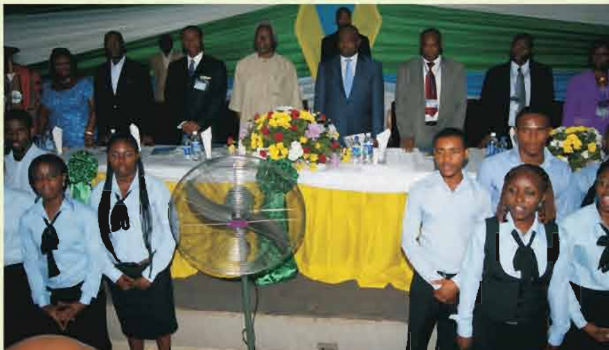
Distinguished guests & members of UNI PORT Choral Concert rise for Hallelujah Chorus