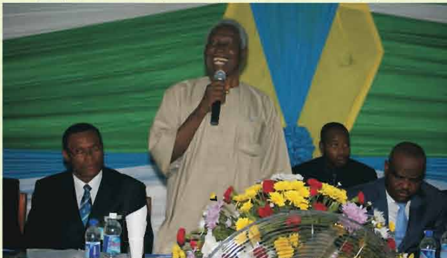
Chairman of occasion, Dr Elechi Amadi, making a speech