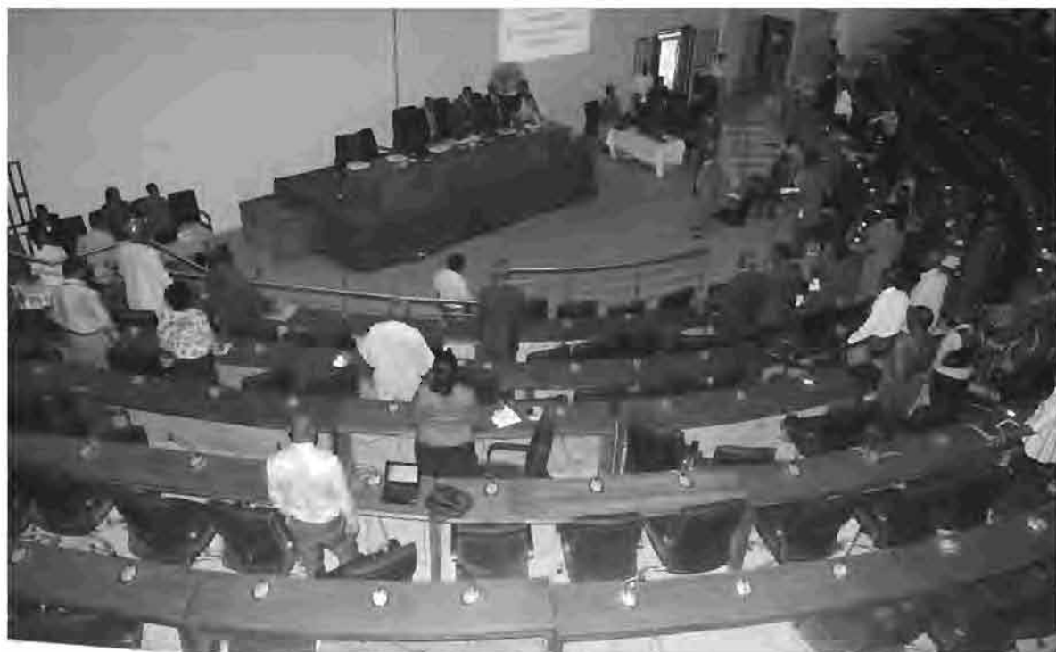
Senate in session