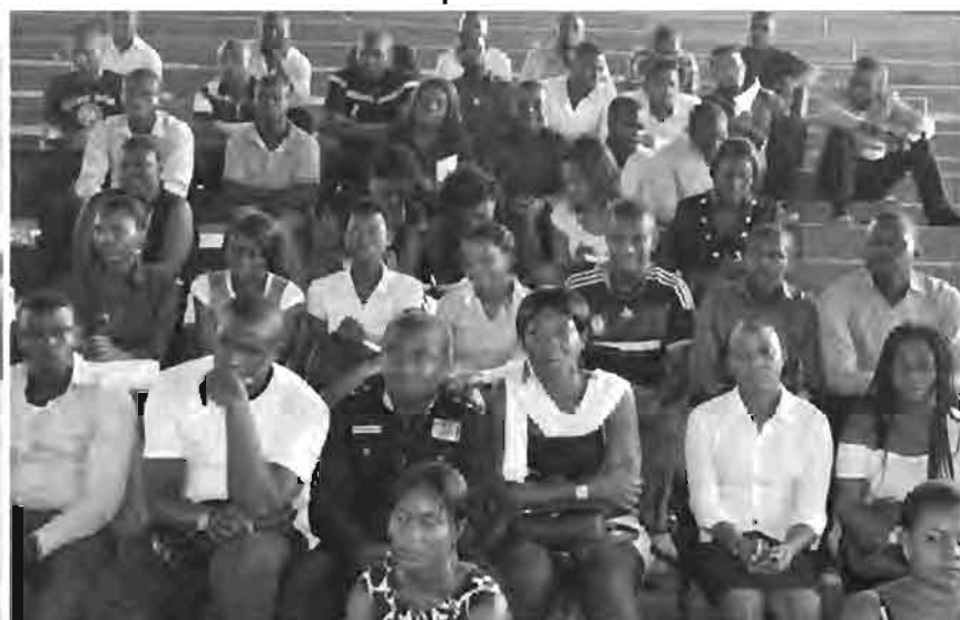
Cross section of prospective Corps Members