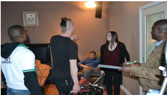
Plate 7: I Instruct My Actors on Spatial Relationships