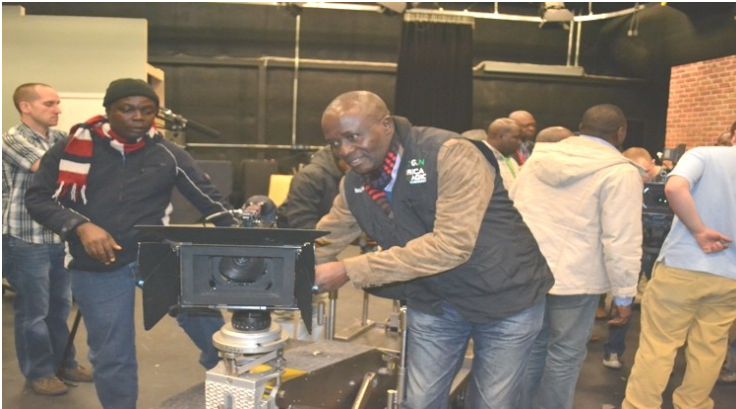
Plate 9: I Confirm Camera Angle to Complement Monitor Output

In 2017, I did my sabbatical with UNAMID in Sudan and produced news stories and documentaries. I served as director, concept developer, scriptwriter, cameraman, voiceover artist, and photographer. The news stories include World Radio Day , JSR Visits Sector East , International Day of UN Peacekeepers , World Environment Day , United Nations Police in the African Union/United Nations Hybrid Operation in Darfur , and UNAMID Closes Eleven Team Sites in Darfur . The documentaries are Signs and Times in Abu Shouk IDP Camp and Drumming for Peace in Darfur .