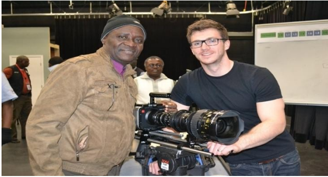
Plate 8: Observing A Dry Run As I Call the Shot on Set