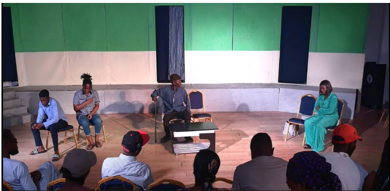
Plate 3: The Emotionally Charged Final Scene of Conflict Resolution in Grit