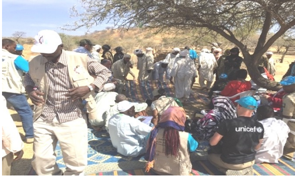
Plate 10: Developing Story Ideas with Darfuris in a Darfur IDP Camp

Its participatory nature made the process inclusive and impactful. Such initiatives show that theatre is more than entertainment. It is a tool for conflict resolution, offering space for storytelling, catharsis, and healing. Feedback shows that theatre can empower communities to envision peace.