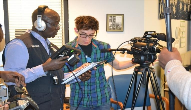
Plate 5: Giving Instructions to the Cameraman on the set of What's Going On? in Colorado Film School, Colorado, USA.