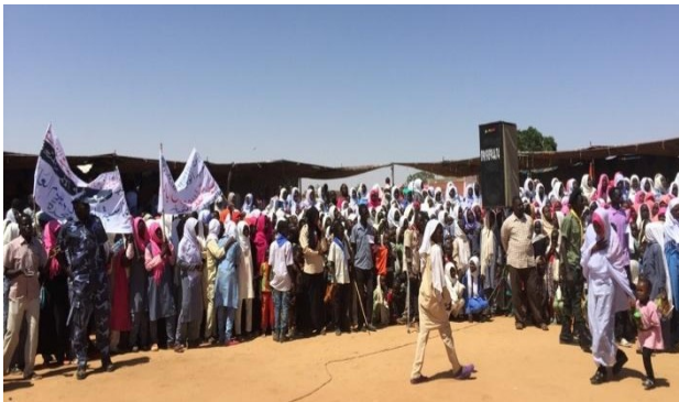
Plate 11: Using Theatre to Promote Peace in Darfur

Its participatory nature made the process inclusive and impactful. Such initiatives show that theatre is more than entertainment. It is a tool for conflict resolution, offering space for storytelling, catharsis, and healing. Feedback shows that theatre can empower communities to envision peace.