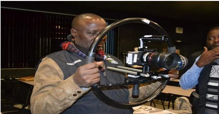
Plate 6: I Check for Shot Composition