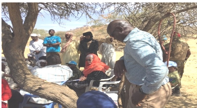
Plate 2: Dramatic Role-playing by Darfuris in Sortoni IDP Camp, Darfur.

During my 2017 sabbatical, I served with UNAMID in Darfur. In Abu Shouk IDP camp (Plate 1), I used improvisation, role-play, and storytelling to help rape victims narrate their experiences. This enabled self-exploration. IDP camp residents were engaged in drama therapy through songs and enactments that offered hope. Drama therapy in Darfur helped war-affected children and victims cope with Post Traumatic Stress Disorder (PTSD) through role-play.