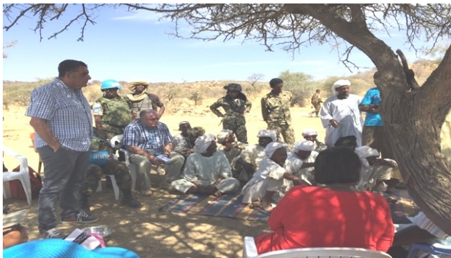
Plate 1: Darfuris in Abu Shouk IDP Camp, Al Fasher, North Darfur, Participate in Songs and Drama Sketches that Offer the Message of Hope.

Drama therapy uses theatre techniques as a psychological treatment. It helps individuals express emotions, explore personal issues, and improve mental well-being.