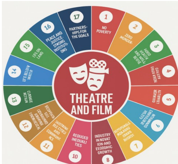
The SDGs as a Desirable Destination in Sourcing a Play or Script

The above diagram presents the 17 SDGs. Building on this foundation, my future directing research will explore dramatic works that address key SDGs such as Quality Education (Goal 4), Gender Equality (Goal 5), Climate Action (Goal 13), and Peace, Justice and Strong Institutions (Goal 16). By situating creative production within this framework, I intend to strengthen the capacity of theatre and film to function not merely as artistic entertainment but as vehicles for civic consciousness and sustainable development.