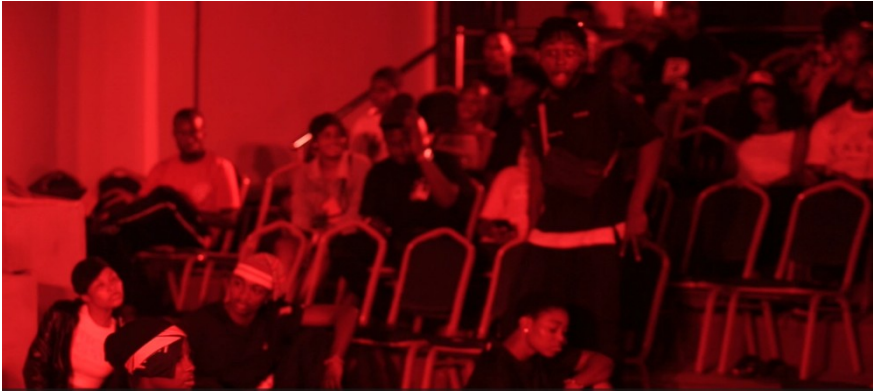
Plate 4: A Section of the Audience in Grit Performance

In selecting these plays, I assess their social relevance, cultural context, ethical purpose, staging potential, and audience's experiences and expectations. Some texts may be intellectually rich but theatrically weak, while others are visually strong but conceptually shallow. To select texts with both depth and vitality, I assess the text's thematic depth, ethical undertone, and performative potential. I balance relevance, interpretive depth, and performative potential to shape audience perception and social understanding. I choose plays that are topical, contemporary, and audience-centred.