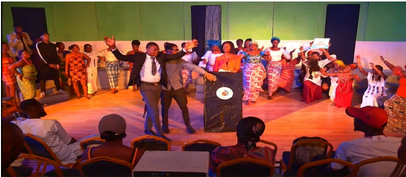
Plate 2: The Scene of Dr. Okote's Election Victory in Grit