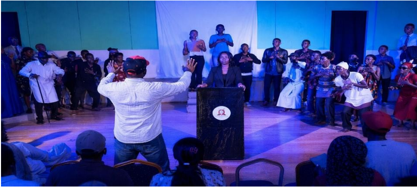
Plate 1: Dress and Technical Rehearsal of Grit